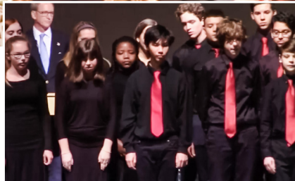
Right: The CEHS choir performed at the ceremony