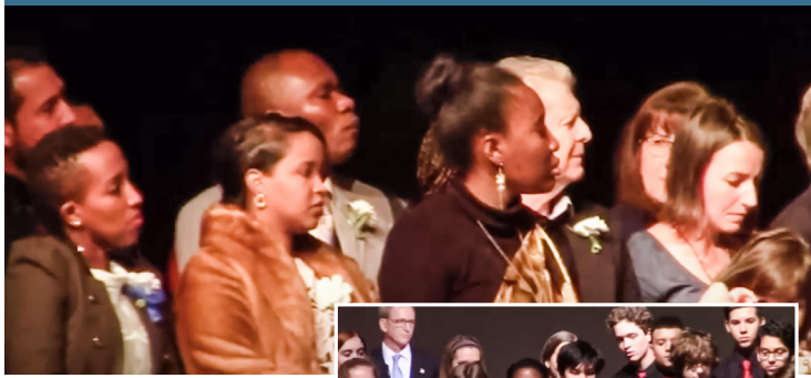
Pictured above: New U.S. citizens