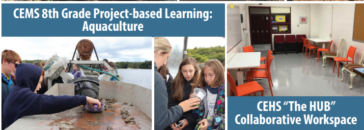
CEHS "The HUB" Collaborative Workspace

CEMS Boys to Men, Hardy Girls/ Healthy Women Workshops CEMS Spirit Series Historical Biography Student-led One Act Plays CEMS Inspired Spaces CEHS Updated Theatre Communication System