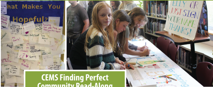
CEMS Finding Perfect Community Read-Along