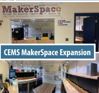
CEMS MakerSpace Expansion

CEMS Boys to Men, Hardy Girls/ Healthy Women Workshops CEMS Spirit Series Historical Biography Student-led One Act Plays CEMS Inspired Spaces CEHS Updated Theatre Communication System