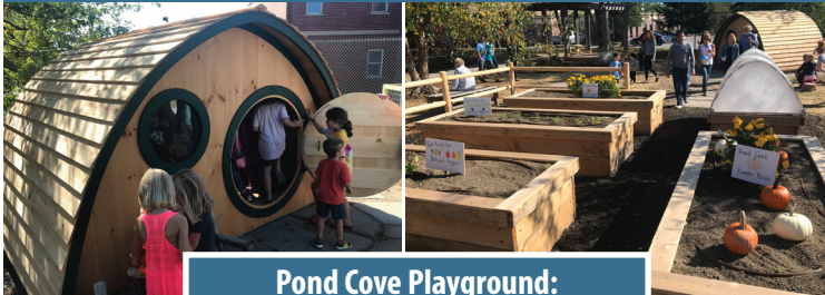
Pond Cove Playground: Natureland Large Impact Grant