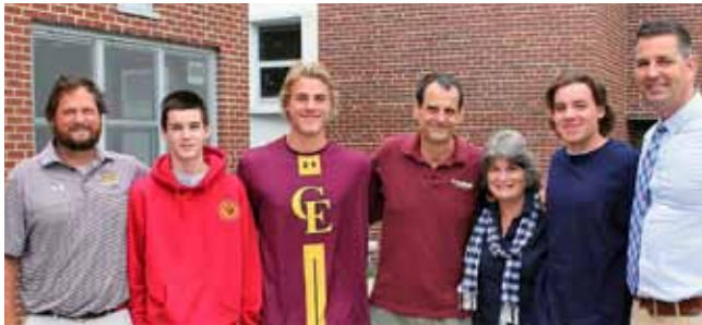
2016 Brownell Award: Freshman Academy