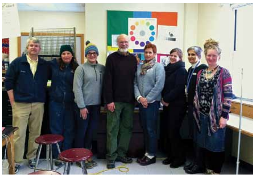
Adults involved in the Animated Integration Studies grant

Donations are from July 1, 2013 to June 30, 2014. We have worked to ensure accuracy and offer our sincerest apologies for any missed or misspelled names or inaccurate information. If you discover errors, please email us at: info@ceef.us.