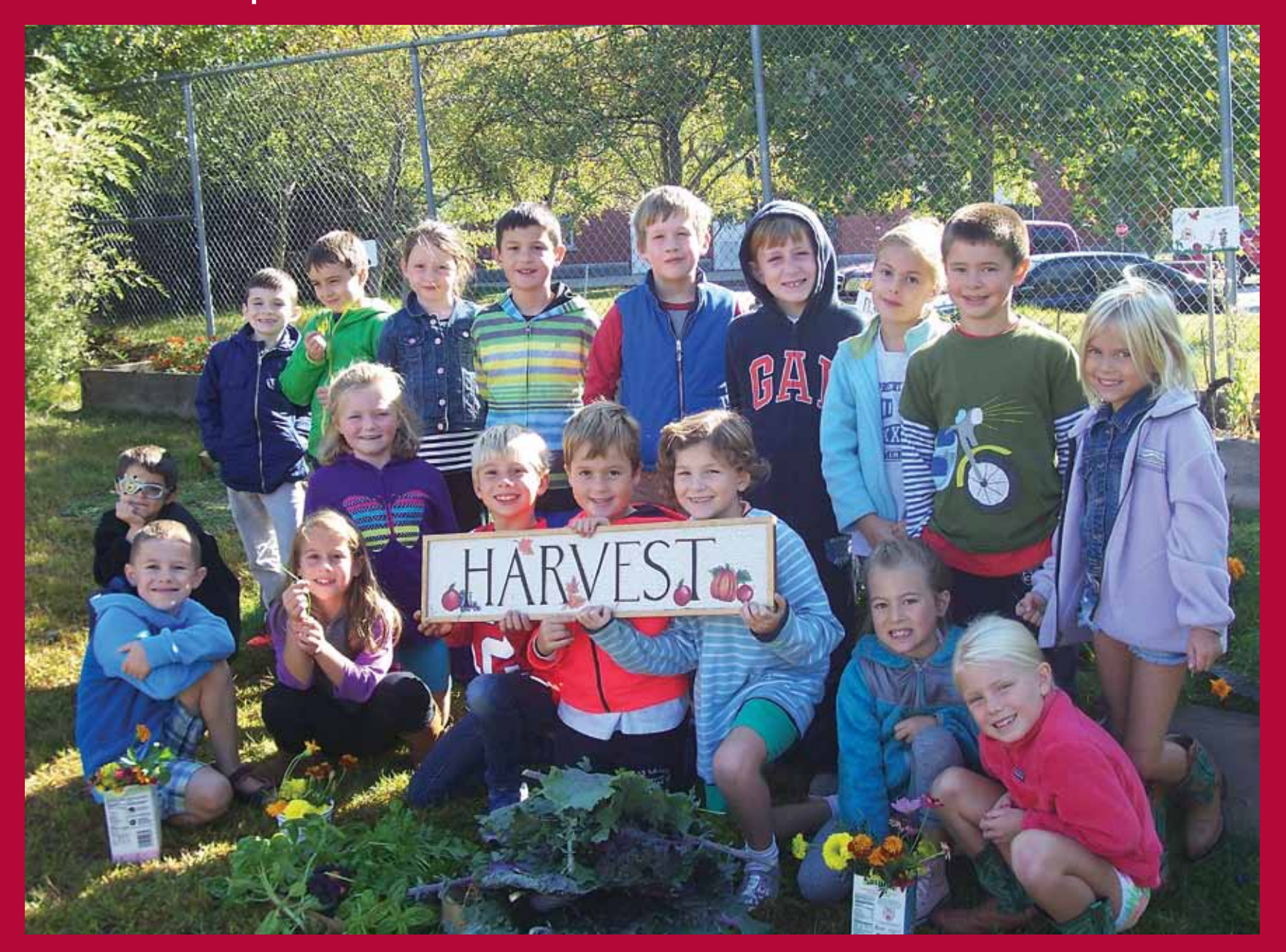
2014 Newsletter & Annual Report