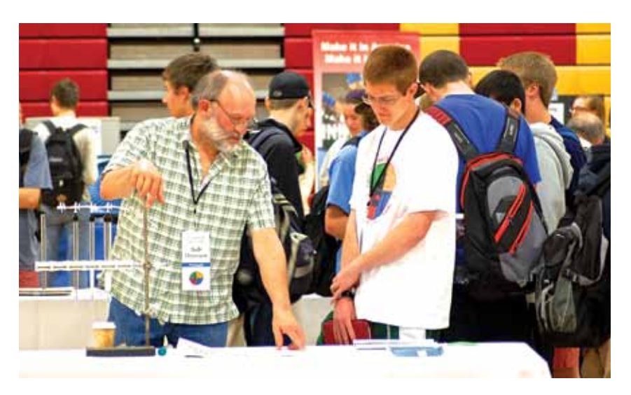
"I liked the STEM Fair because it opened new ideas and opportunities for jobs that I would've never thought were associated with math and science."