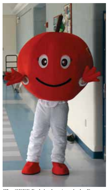
The CEEF Red Apple enjoys AuthorFest