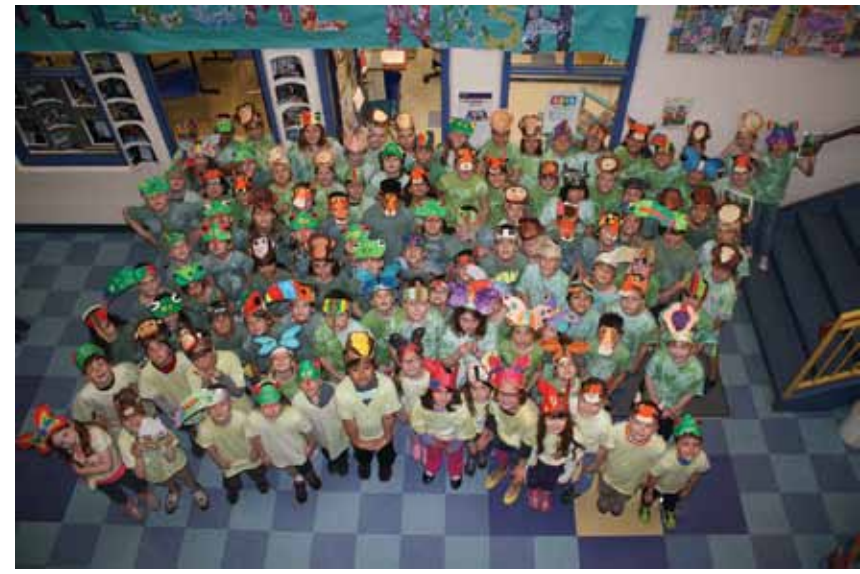
Pond Cove joins in the literary fun

"Literacy week was an incredible opportunity for students and staff in all of our schools and community members to interact with artists and authors and others employing literacy skills in their professional lives. AuthorFest in particular was a spectacular event and one that we hope to continue to offer in the future. CEEF was an incredible partner for this event, and we were grateful for their support to make the many events during the week possible."