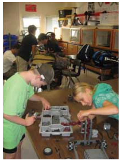
Robotics enthusiasts work on their project