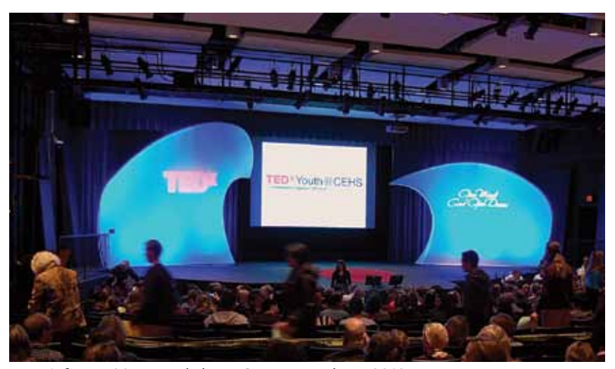
Maine's first ever TEDxYouth day at CEHS, December 7, 2012