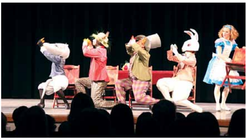
Students enjoy a performance of Alice in Wonderland by the Maine State Ballet

"During CEHS robotic's program infancy, CEEF recognized the importance of STEM related extracurricular activities and provided important initial funding. The program has grown from just a few to now nearly a hundred participating at each education level of our school system. The children are introduced to engineering, programming and project management in a fun and interactive way."