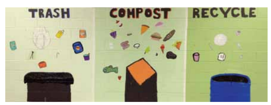
The Waste Management mural on the Cafetorium wall helps students to sort their leftover waste