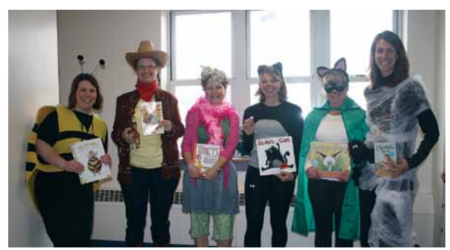
Pond Cove teachers prepare for the character parade during Cape Celebrates Literacy week