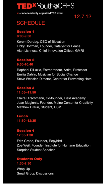
TEDx Youth nametag with the day's program